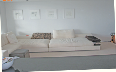
BEFORE: A blank, lifeless room

W e were given a brief to turn this apartment living area from bland into warm and inviting with a metro twist and a splash of colour. Our first task was to work out our colour palette. We went with dark greys and a burnt orange, complemented by black and silver. We wanted to create a cosy nook for the new lounge to sit in so we designed and installed some bespoke wall cabinets. These were faced in laminex and blackened linewood and created the base for our palette. All the new furniture in the lounge area matched the cabinet tones. Now for the splash of colour – we had a new breakfast bar installed, 2pac coated in Dulux playschool. Oversized artwork behind the lounge completed the look perfectly.